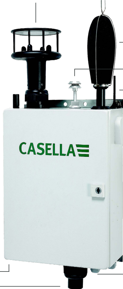
Microphone protection system